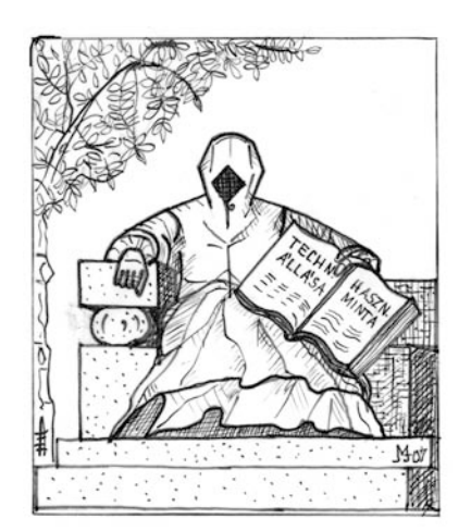
Anonymus = Always a fictitious person skilled in the pertinent art

man or women without any face, as we illustrated in the drawing below).