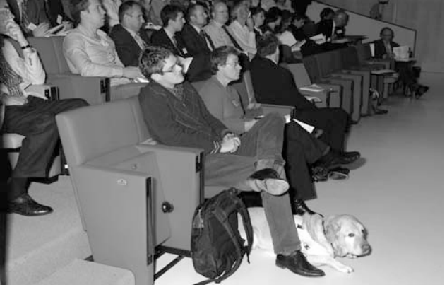
Among the participants, a blind man with his dog